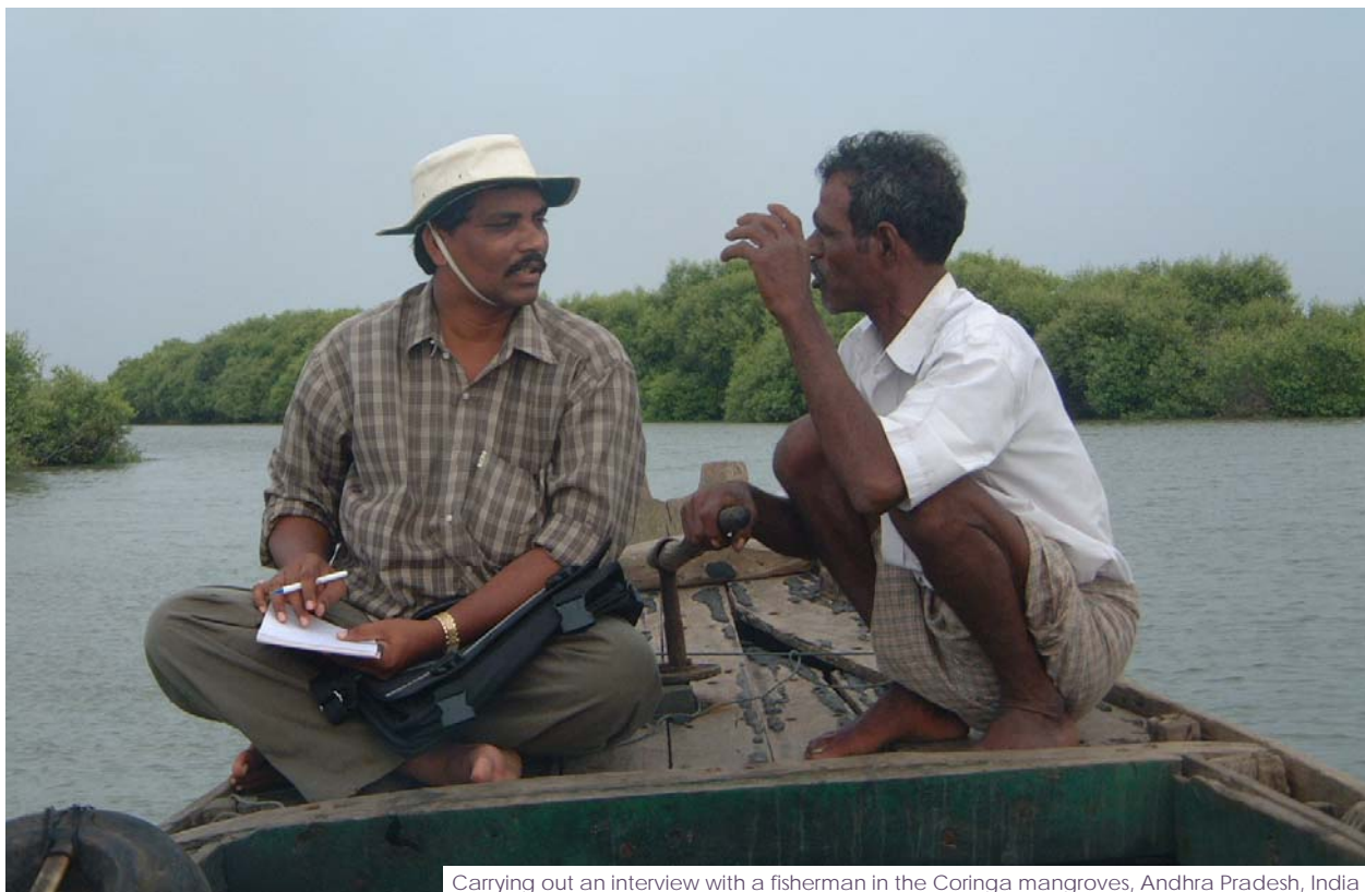
Carrying out an interview with a fisherman in the Coringa mangroves, Andhra Pradesh, India