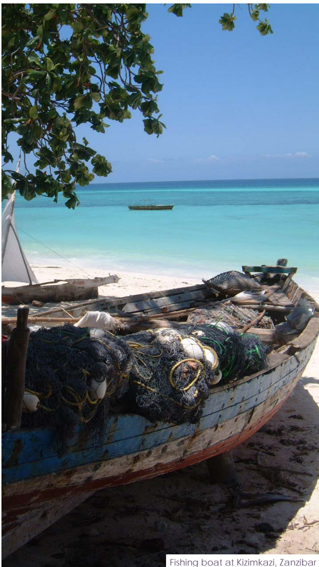
Fishing boat at Kizimkazi, Zanzibar

Fisheries are the main source of animal protein for nearly one billion people, predominantly in developing countries. There are an estimated 10 million full-time, traditional fishers in developing countries, and a further 10 million part-time fishers. When families and dependents are included, an estimated 100 million people depend on fishing, many of them among the world's poorest. The employment and income generation that small-scale fisheries provide in often-remote coastal areas is important to livelihoods and the rural economy.