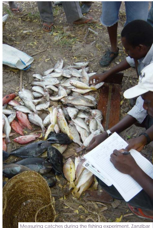
Measuring catches during the fishing experiment, Zanzibar

The ParFish process includes a stage for management planning for stakeholders to discuss the results of the ParFish assessment, other problems encountered in the fishery and to consider possible management solutions. This stage, which is not necessarily covered by conventional stock assessments, helps ensure that the results are translated into practical actions for fishery management.