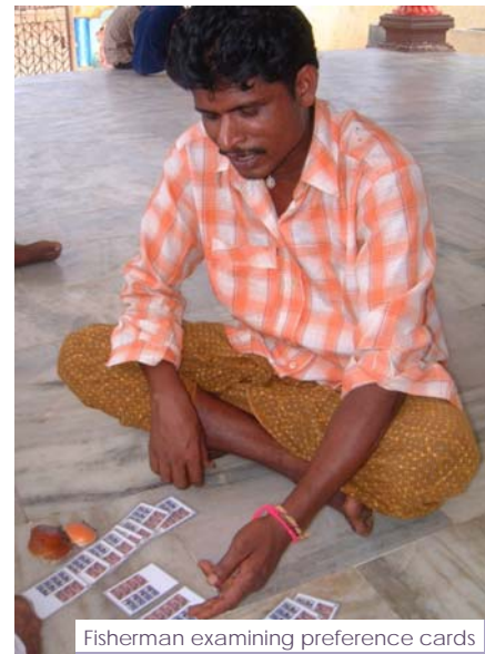
Fisherman examining preference cards

ParFish uses Decision Theory to incorporate social and economic aspects into the stock assessment and to identify the outcome in the fishery that would be most preferred by the fishers. This is used to identify the expected best control measure to apply. Fishers indicate their preferences for scenarios of different levels of fishing effort and associated catch (i.e. costs and benefits), which reflect relative trade-offs each individual faces between fishing and other livelihood activities that he or she could be engaging with instead. If fishers have few other livelihood options they may prefer to be able to fish every day, even if their catch rates are lower, than to be able to fish only one or two days a week with a higher return. In this way, ParFish incorporates the social and economic trade-offs and priorities of fishers in the assessment and takes account of them in the recommendations.