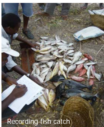
Recording fish catch