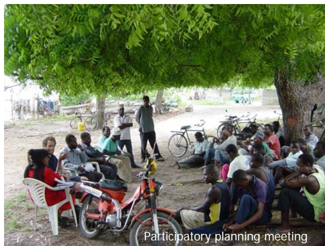
Participatory planning meeting

Following the experience of developing management action plans with the fishers in Kizimkazi the ParFish Toolkit will be finalised. It will consist of the user-friendly software and guidance for undertaking stock assessment and management planning using the ParFish approach.