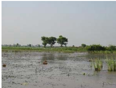
Lotus plantation in Tamul Leu in Cambodia causes conflicts among fishers and lotus farmowners

In the Bangladesh study, the sites included the communities in the Titas River, an open access for fishers and other users, passing through the district of Brhamanbaria. Another site was the Shapla Beel situated in Gokorno union of Nasirnagor Upazila of Brhamanbaria.