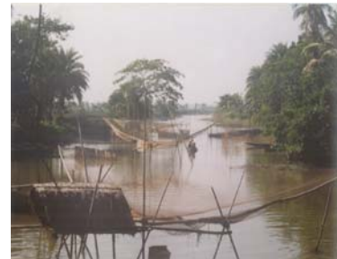
Patibandh, “fences” across the beel are installed by influential “investors”, mostly non-fishers, to obstruct migration of fish, raises conflict with common fishers