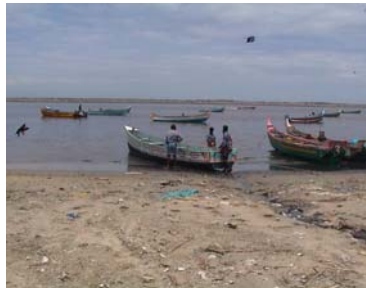
Competition over access to fishing grounds breeds tension between traditional and mechanized fishers in Kollam, Kerala, India